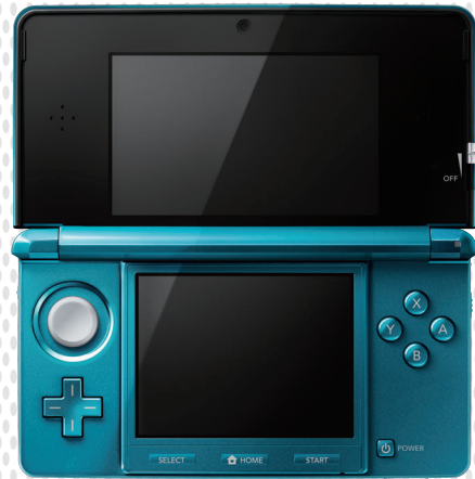
NINTENDO 3DS™ NINTENDO 3DS XL™