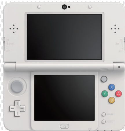
new NINTENDO 3DS™ new NINTENDO 3DS XL™